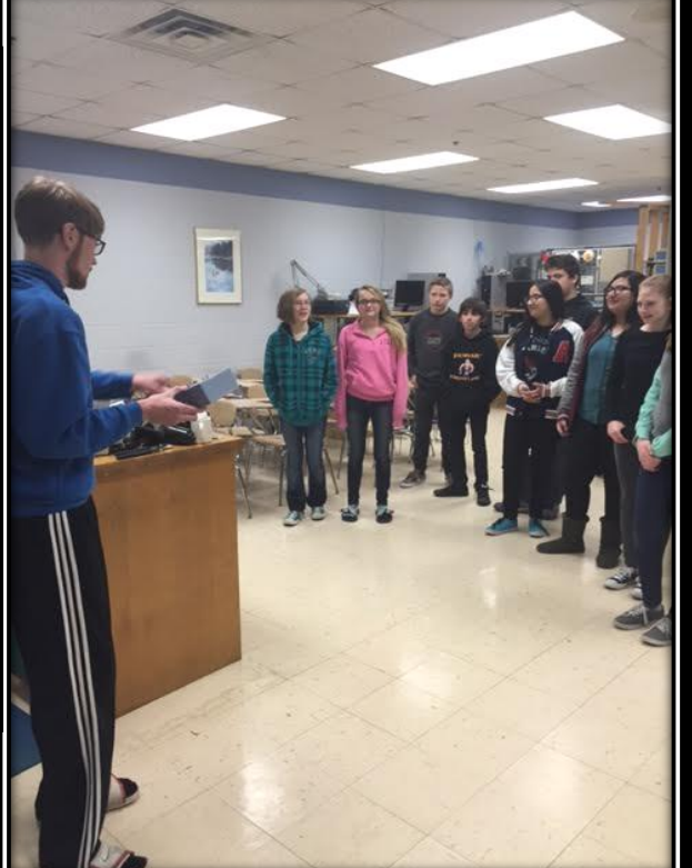
Students get to experience a lot of different occupations during their visit to the Career Center.